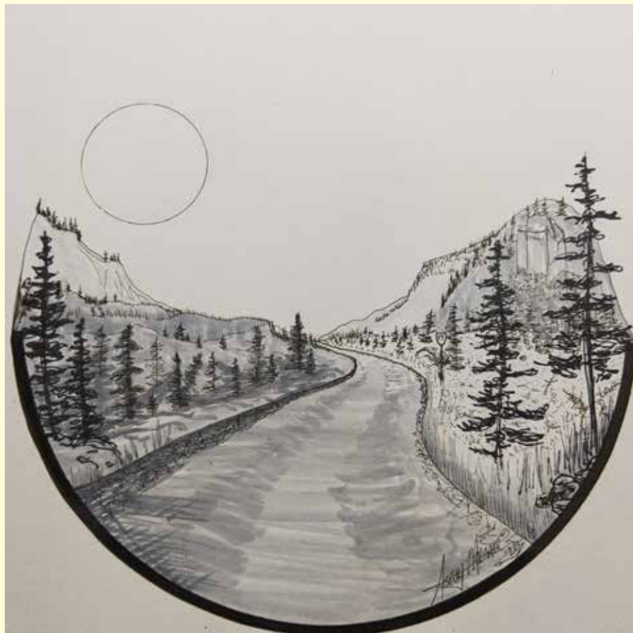
ILLUSTRATIONS BY ASHLEY MOREAU

According to Indigenous scholar Harlan Pruden (Nēhiyo/Cree), two-spirit is an organizing strategy which can be used to “...organize the Indigenous Peoples of Turtle Island who embody diverse sexualities, gender identities, roles and/or